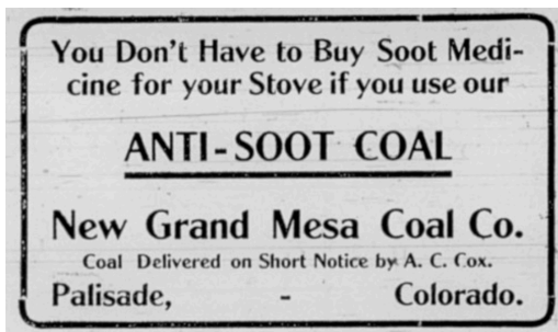
Palisade Tribune ad from March 4, 1905.