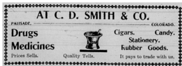
Palisade Tribune ad from March 4, 1905. Editor's Note: The C.D. Smith & Co. was located in the Jordan's Inn, which was where the Plaza is now at the corner of Third & Main in downtown Palisade!

Here is our schedule for the month of March! We would be lucky to have you visit us!