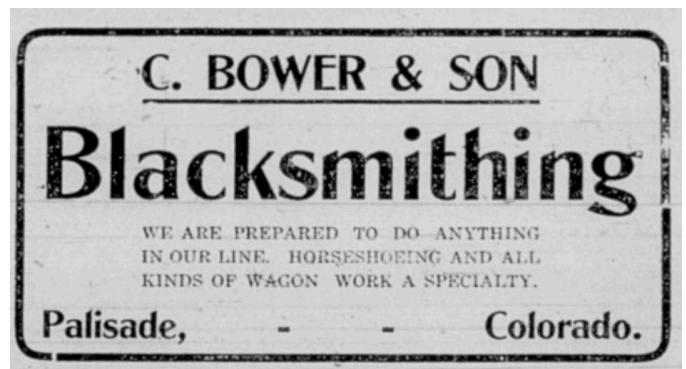
The Palisade Tribune - February 4, 1905

There are 4,154 issues of The Palisade Tribune available on the Colorado Historic Newspapers Database, with more on the way. Check out our Newspaper Tab on HistoricPalisade.org for more information!