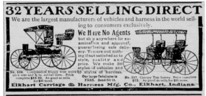
The Palisade Tribune - February 11, 1905

The Palisade Tribune ads in this issue are from February 1905, which is 120 years ago!